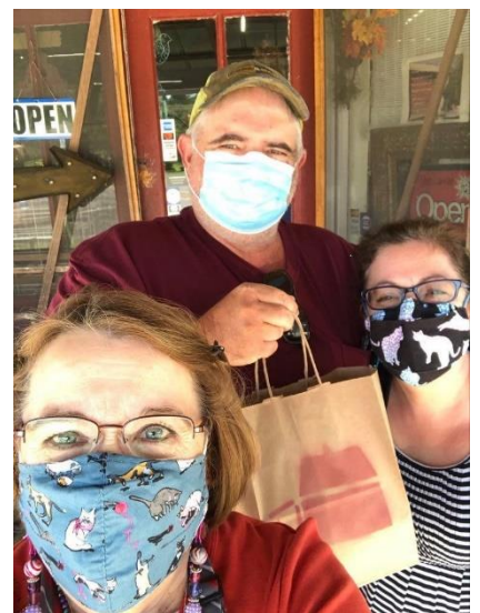
Travel writer visits the Little Red Barn Pottery & Art Gallery in Barnwell.

We want you to feel safe whether you are traveling locally or from afar. Our new Healthy Travel Information page provides a variety of resources to help you travel confidently. Check it out: https://www.tbredcountry.org/healthy-travel-information