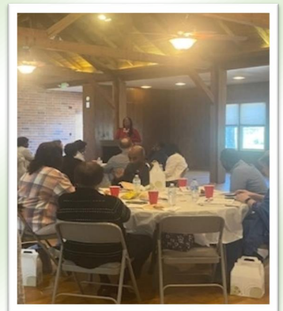
One of the attendees speaking at the event.

Closing out the workshop, the PCED staff each shared how services can help towns, cities, and counties in all facets of planning, transportation, housing, grants, and community development. The PCED staff serves to help develop projects of all types, to leverage funds, and seek grant funding to make projects possible. All towns, cities, and counties are encouraged to talk with the PCED staff for project success.