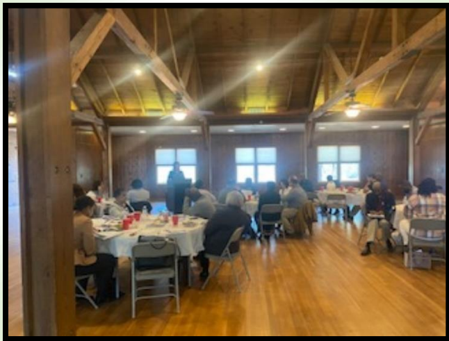
Workshop event at the Barnwell State Park