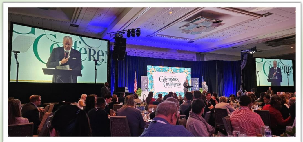
Governor Henry McMaster pictured giving a speech at the event.

The three-day conference included a slate of leading experts presenting on top trends and topics impacting the industry, from AI to Anthony Melchiorri, host and co-executive producer of Travel Channel's Hotel Impossible.