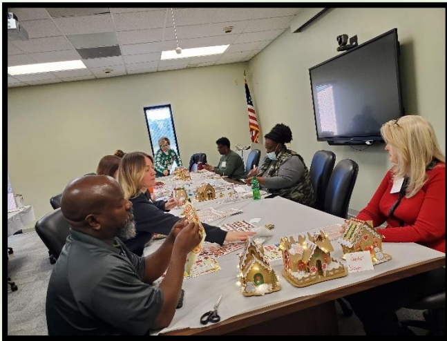
Lower Savannah COG staff pictured making Gingerbread houses.

LSCOG staff participated in a fun-filled retreat on December 19, 2023. Activities included building a Gingerbread House a la the Great British Baking Show model with time constraints and “ingredients” provided out of cardboard, stickers, glitter, “snow”, and markers. On this sunny, brisk day, staff then proceeded to South on Whiskey for a friendly mini-golf tournament, and gift exchanges.