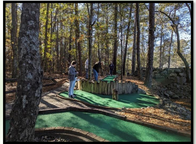
Staff participating in a game of mini-golf.