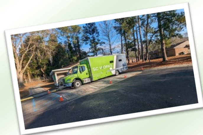
Workforce Mobile Unit

April 25 – Hire Summit, Orangeburg City Gym, Orangeburg SC, 9 am to 1:30 pm